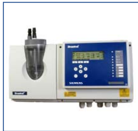
Strantr ® MGL 5 Controller