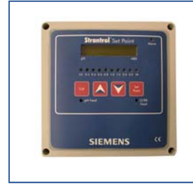
Strantr ® Set Point Pool & Spa Chemistry Controller