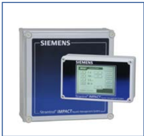
Strantr ® Impact Aquatic Management System

Strantr is a trademark of Siemens, its subsidiaries or affiliates.