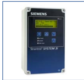
Strantr ® System 3i Pool & Spa Chemistry Controller